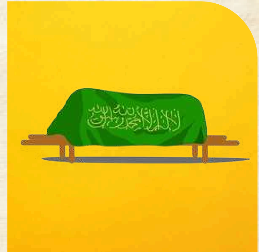
The circumstances surrounding his death and the legacy he left behind