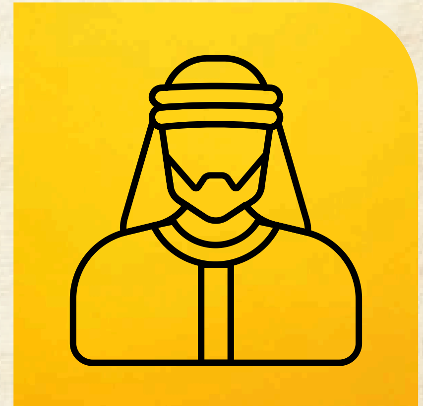
A description of the physique and noble features according to classical sources