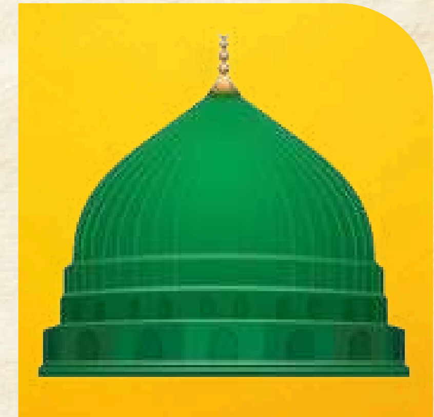
His role and presence during the Prophet's final illness and passing