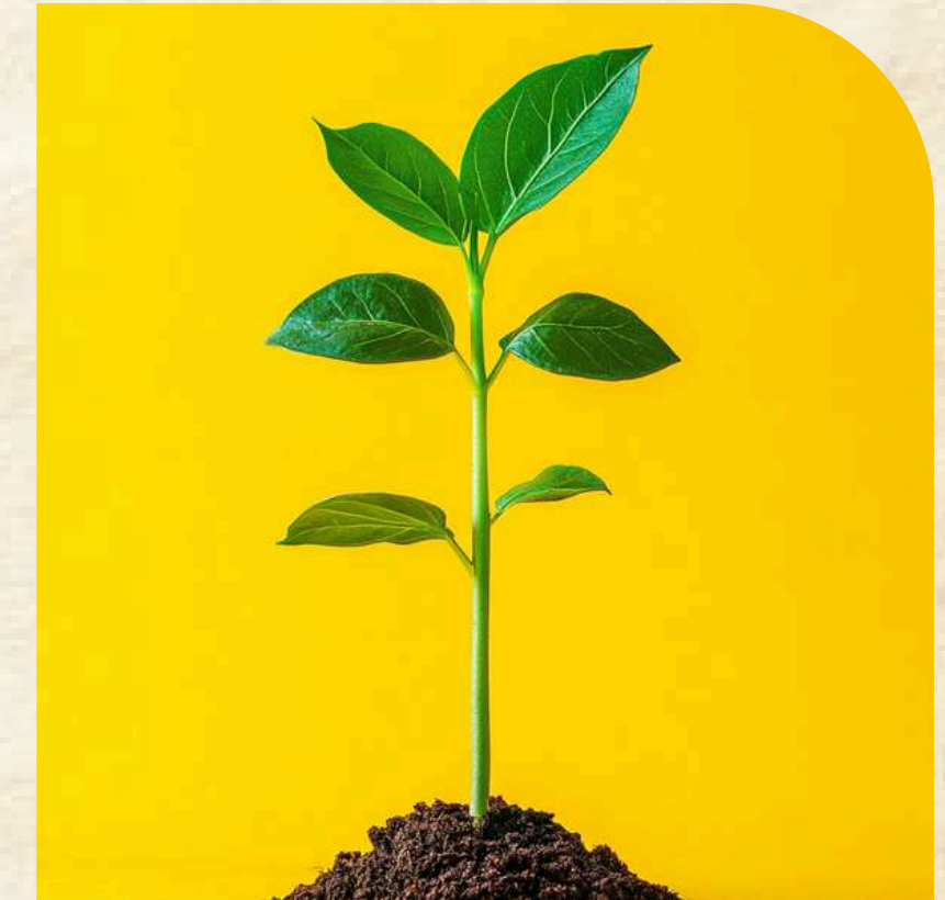
A glimpse into his childhood and background before Islam