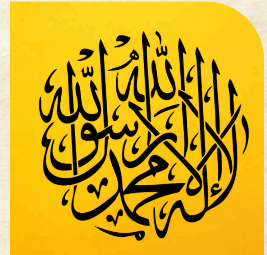
The moment he accepted Islam and its impact on his life

These five would later become part of the Asharah Mubashsharah (the ten promised Paradise).